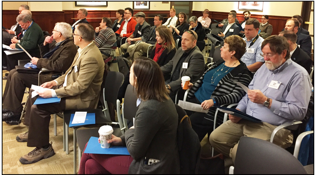
Attendees at the Kansas Press Association's Day at the Legislature on Feb. 2 get a review of the top legislative issues and instructions for the day. See another picture on Page 4 and KPA's legislative watch list on Page 9.

The annual meeting of the William Allen White Foundation Board, Lawrence.