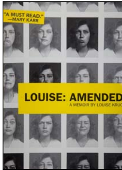
The cover of Louise Krug’s book.

Krug had a cavernous malformation, or a cluster of abnormal vessels, the size of a marble in her brain stem, the area that controls vital functions such as swallowing and breathing. A neurosurgeon