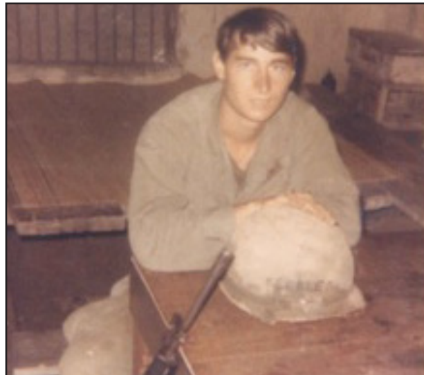
Two of the many pictures discovered for the Vietnam Memorial "Wall of Faces" were Emporia native