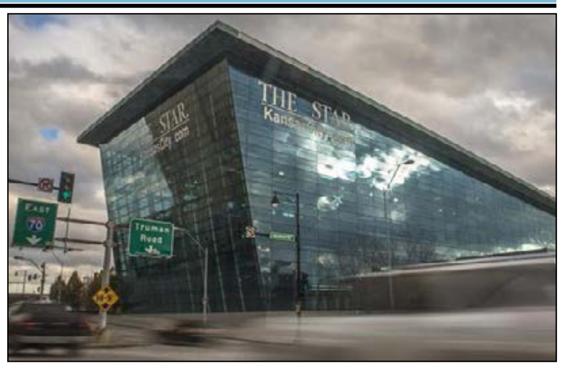
The iconic Kansas City Star Press Pavilion will close some time in 2021, potentially transferring the printing of the Star and other newspapers to Des Moines. The new facility was dedicated in 2006.

Kansas Press Association annual convention, Meridian Conference Center, Newton.